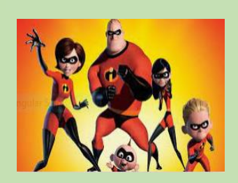
Books we will read