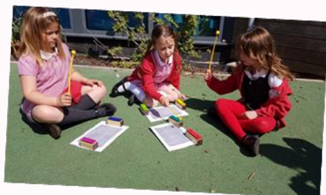
Sennen Class have been creating music in the sun.