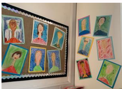
Gwithian have created stunning artwork – portrait style!