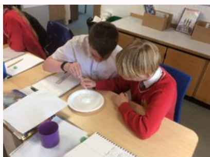
Lamorna Class have been investigating weathering and erosion in Geography.