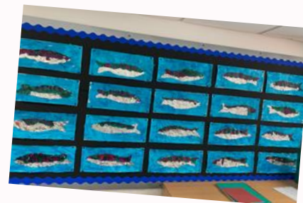
Porthcurno Class have produced beautiful artwork inspired by Cornwall's fishing heritage.