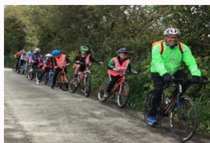
Gwenver Class have been learning to ride their bike safely with Bikeability sessions.