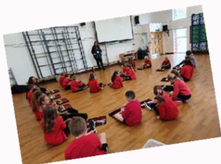
Kynance Cove Class have started their flute lessons – all managing a sound!