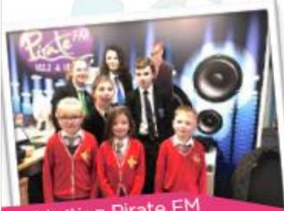
Visiting Pirate FM

I am pleased to say that the partnership will be officially welcoming the next three schools to join us from the 1st April 2019 to bring us up to a total of five. This has been as a result of a lot of hard work and planning by all those involved, however the rewards for all of us will be immense and I can't wait to see some of our plans come to fruition over the coming months.