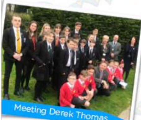
Meeting Derek Thomas

As part of the current climate change debate, partnership students had the opportunity to meet with Derek Thomas MP to talk about some of the things that concern young people today. Everyone had some great ideas and I am pleased to say that we have agreed to look into the possibility of working together with Derek on a programme of tree planting on all of our campuses. This will be a great opportunity for everyone in the community to make a contribution to our environment. We will be setting some dates in our diary for after Easter and will let you know as soon as you can get involved.